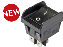
Lateral protection frame.